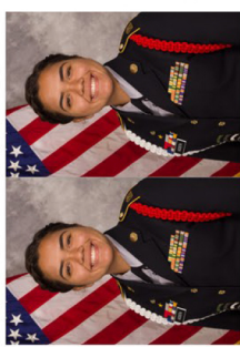
2 - 5x7