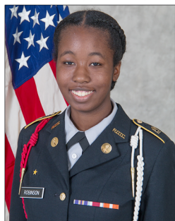
1 - 8x10

(Instructions: We take (4) poses. Pose (1) Face, (2) Attention, (3) Parade Rest, (4) Salute. Please pick your pose for each picture sheet as shown in package (A) below. If you do not pick your pose, then pose (1) will be used. Package (J) is always as example.)